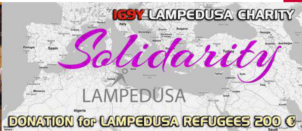
IG9Y TEAM with DONORS