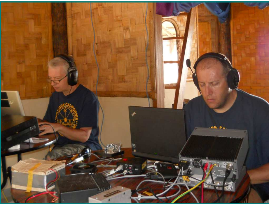
VK2IA and VK8NSF operating CW

It took two days to track down the source of the noise. It turned out to be a Chinese-made mains inverter that Barry used from time to time to power a 220V fridge, freezer and satellite television