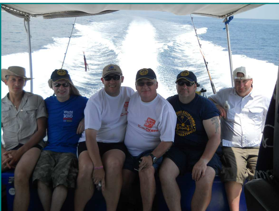
4W6A team on boat

All the operators paid their own air fares from the UK, Malaysia and Australia to Timor-Leste, plus their own accommo-