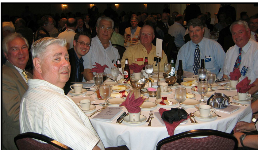
Some NODXA members at the club table at the DX Dinner Banquet.